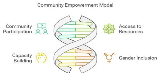
Figure 4: Model of Community Empowerment Framework (community Participation, Access to Resources, Capacity Building, Gender Inclusion)

These themes suggest that while empowerment programs have positive impacts, there are critical barriers that must be addressed to achieve comprehensive and sustainable rural development.