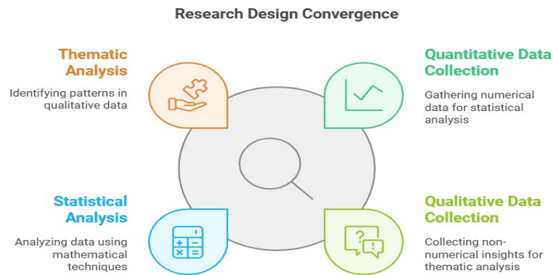
Figure 2: Research Design (Data Collection Phase (Surveys and Interviews), Data Analysis Phase (Statistical Analysis and Thematic Analysis), Key Findings)

The data analysis approach combines quantitative statistical methods with qualitative thematic analysis, ensuring a comprehensive understanding of empowerment strategies and their applicability within Afghanistan's unique socio-economic landscape. This mixed-methods approach is ideal for capturing both the numerical trends and nuanced perspectives critical to rural empowerment studies.