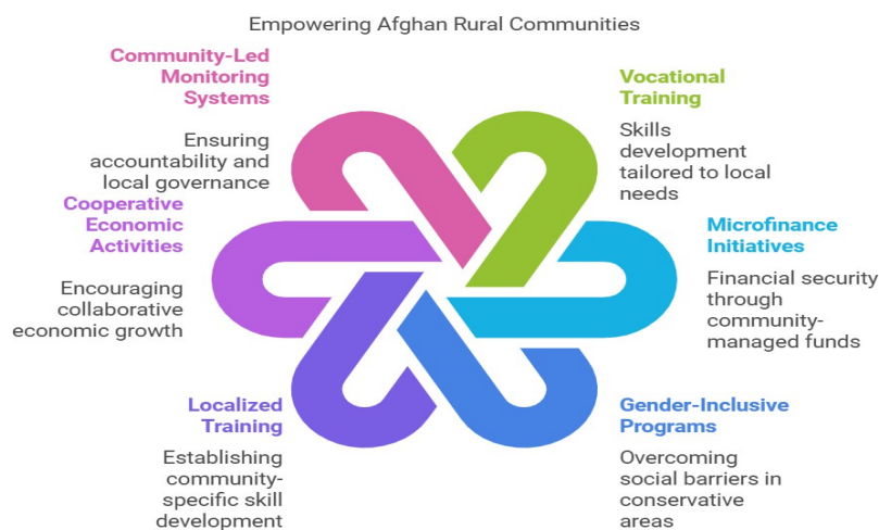
Figure 5: Key Points for Empowering Afghanistan Rural Communities

This comprehensive analysis of both quantitative and qualitative data highlights the value of empowerment strategies in transforming rural Afghan communities. Empowerment programs are shown to improve income, educational levels, and social cohesion. However, achieving sustainable empowerment requires addressing local barriers, emphasizing capacity-building, and fostering community-led initiatives. This study provides valuable evidence for stakeholders and policymakers seeking to enhance the efficacy of empowerment programs within Afghanistan's rural landscape.